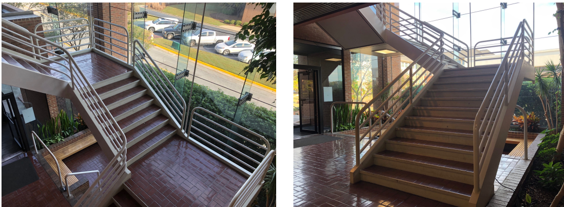
Figure 5: Image of Suspended Lobby Stair

For the second computer modeling lab, students were asked to produce a 3D computer model of the suspended switchback lobby stair in the main engineering building on campus. The lobby stair shown in Figure 5 below, was chosen due to its geometric complexity and three-dimensional aspect. Working in groups, students measured the sizes and dimensions of all the major structural elements, and determined the loading on these structural elements. Based on the sizes and measurements obtained from the site visit, the students modeled the stair in 3D and were asked to determine the safest location to place a 500-lb Mercer Bear statue on the stair.