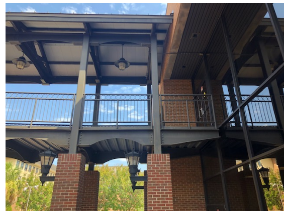
Figure 1: Exterior walkway between two campus buildings

The students were provided the external loads on the structure. Working in groups, they had to measure the length of structural elements and use the information to determine the load path of this existing structure. The students had to determine how much load and what type of load is carried by each of the floor members, and use that information to draw free body diagrams of each member.