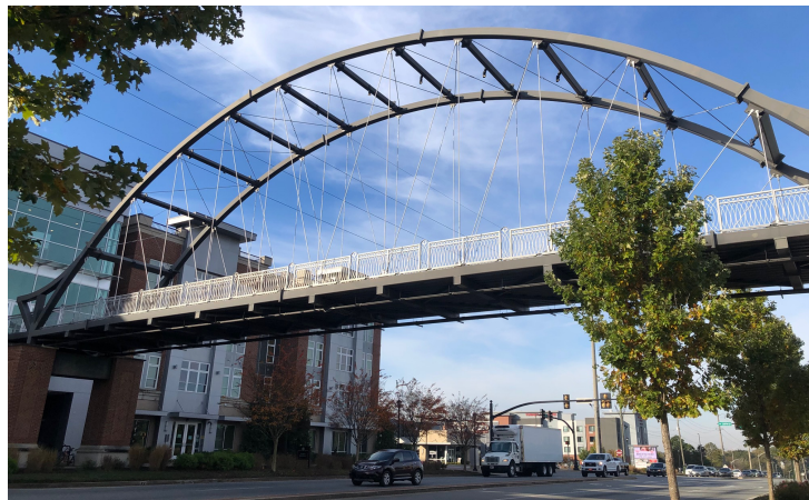
Figure 4: Tied arch Pedestrian Bridge

Figure 4 below is an image of the pedestrian bridge on the Mercer University campus which connects on-campus student housing with the Mercer football stadium. For this lab, students worked in groups to determine the sizes and dimensions of all the major structural elements. They then used concepts learned from the load tracing lab to determine the loading on all the structural elements. Based on the information collected, the students used Visual Analysis to model the tied arch pedestrian bridge in 2D and were asked to determine the safest location to place a 500-lb Mercer Bear statue on the bridge.